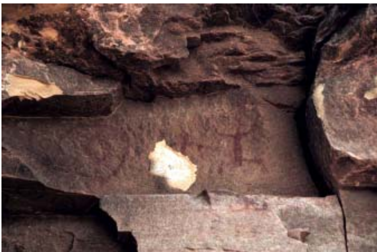
Photograph 1, left. Photographs 2 and 3, opposite page, top, left and right.

Who would have believed we would experience this terrible drought and the devastating fires we've had now for several years? Damage caused by wildfires is one reason it's so important to document rock art sites. Next time you go back to a panel, it may have ceased to exist.