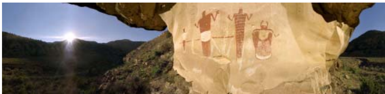
Sheep Canyon panorama by Diane Orr.

The exhibits are scheduled to open during the public comment period for the revised EAs.