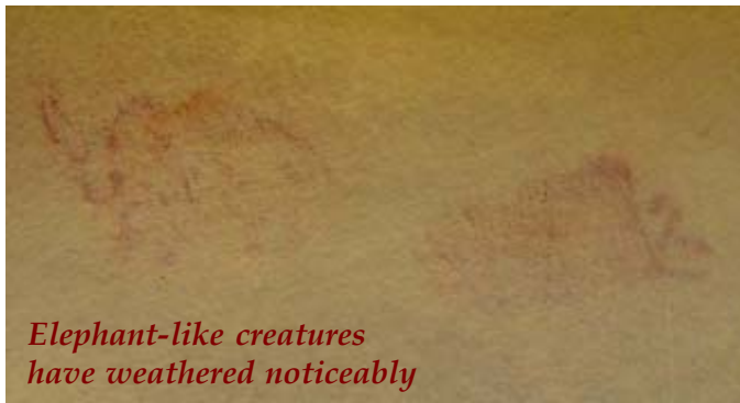
Elephant-like creatures have weathered noticeably