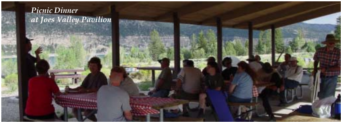
Picnic Dinner at Joes Valley Pavilion