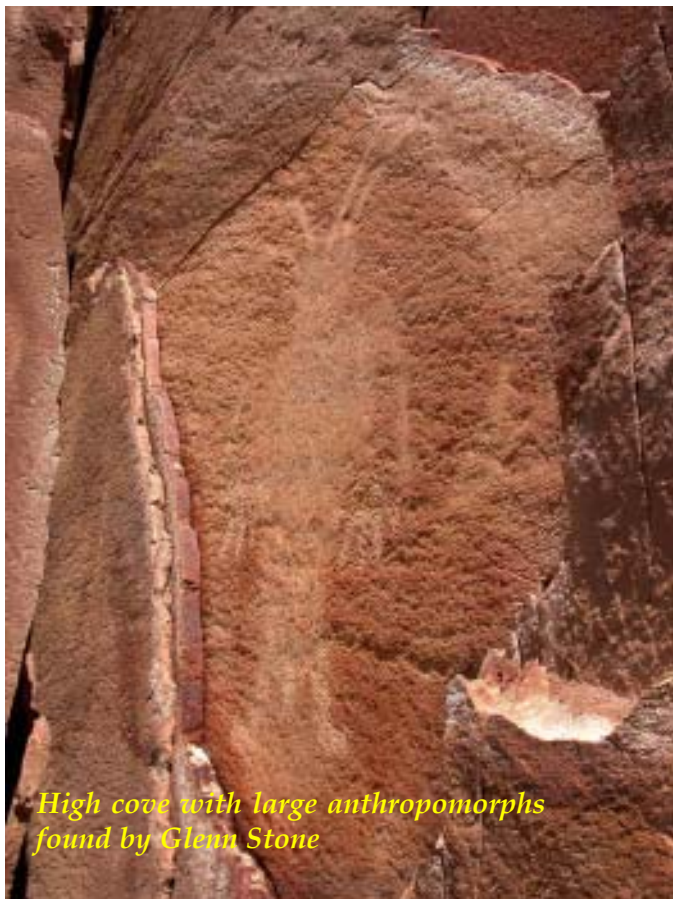
High cove with large anthropomorphs found by Glenn Stone