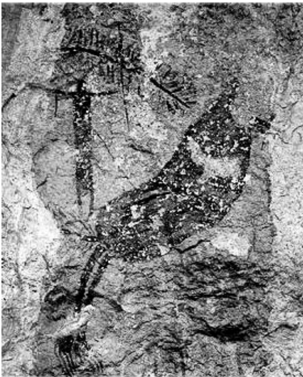
Pecos River Style, left, Mystic Shelter, right, Panther Cave.

URARA Utah Rock Art Research Association Box 511324 Salt Lake City UT 84151-1324