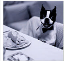
Who Invited the Dog?