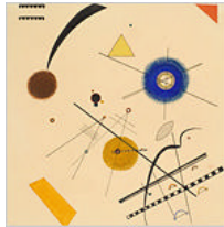
For Los Angeles Museum, a 'Transformative' Gift