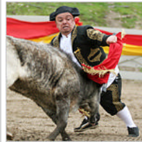
A Chapter of 'Jackass' as Web Test