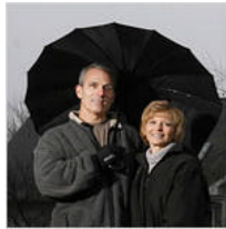
Homespun Electricity, From the Wind