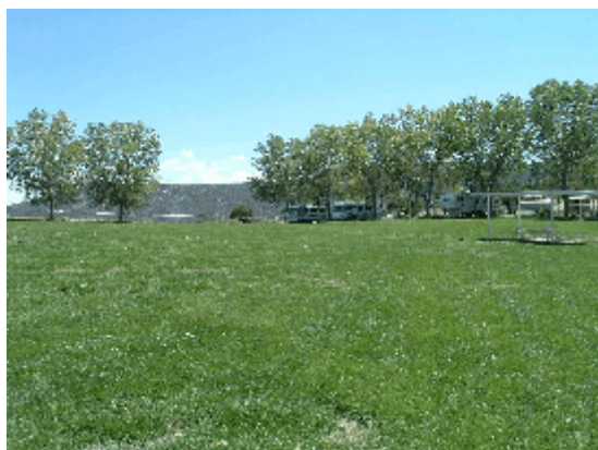
Main tent area at Elks Campground.

1993 Sixty Years of Southwestern Archaeology: A History of the Pecos Conference . University of New Mexico Press, Albuquerque.