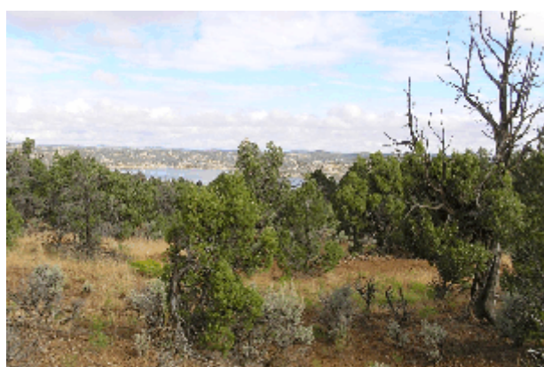
Camping area at Elks, with view of Navajo Lake.